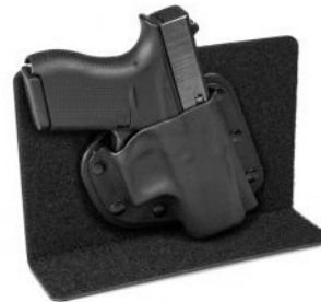
Crossbreed Purse Defender