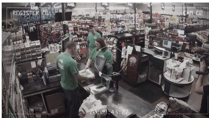
Click here to watch the entire episode

So when we got an invite to participate in Season 7 of First Person Defender three of our instructors jumped at the chance to participate in some force-on-force